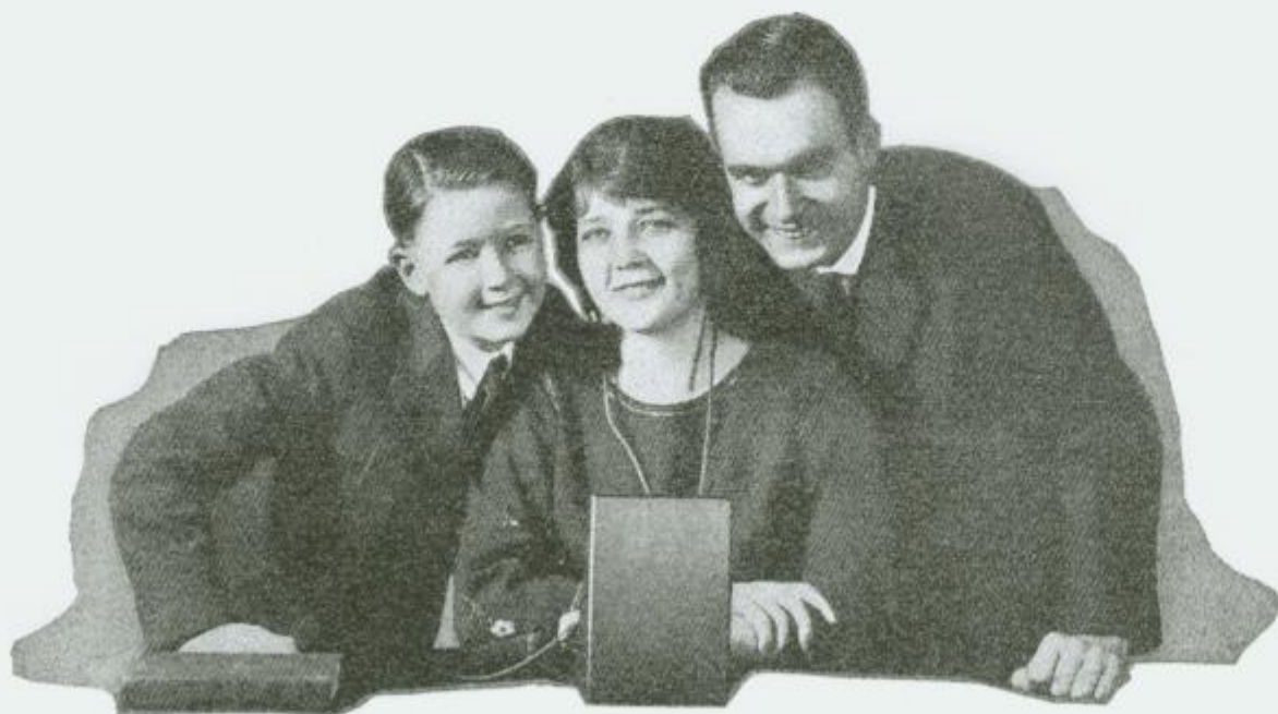
"Listening in" with Radio Receiver, Model ER-753

A LL that radio broadcasting has to offer from the opera to dance music, from discourses by world-famed lecturers to bed-time stories for the youngsters, is brought into your home by this simple receiving set. You listen to the news of the day, market reports and time signals sent out by United States Government stations; you hear popular entertainers in person singing their hits of the day, or telling jokes; in a word, the world's celebrities become visitors to your home and friends of your family. And best of all you need learn no code or have any electrical knowledge—simply run a wire into the air and connect another in the ground and you have at your command, news, instruction and entertainment.